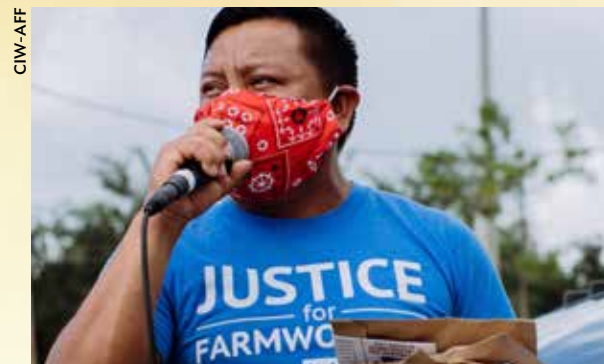
Coalition of Immokalee Workers calls for food justice.