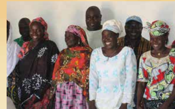
Cameroonian women show how to share resources through a successful community grain bank.

Find worship resources, including sample prayer, 10 Commandments of Food and bulletin insert to celebrate the Food Week of Action each October. The Global Food Week of Action includes World Food Day (Oct. 16), International Day for Rural Women (Oct. 15) and International Day for the Eradication of Poverty (Oct. 17). See pcusa.org/foodweek .