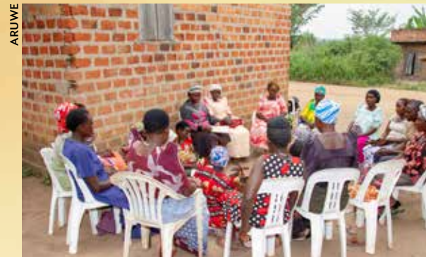
Ugandan women gather for a community meeting.