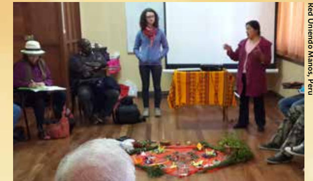
Joining Hands Network in Peru meets with U.S. Presbyterians.