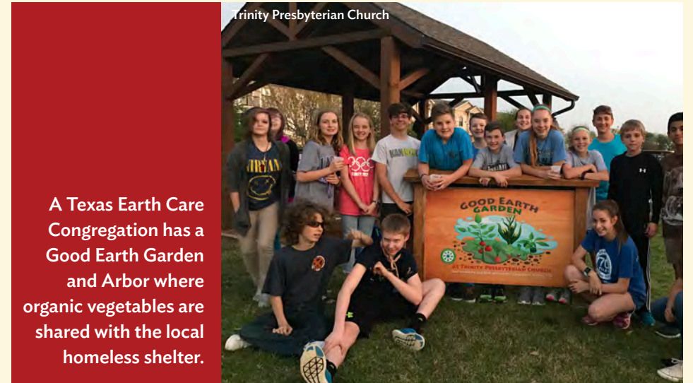
Trinity Presbyterian Church

A woman from Kangama in Sierra Leone preparing rice seeds. Kangama is a very active village participating in the West Africa Initiative.