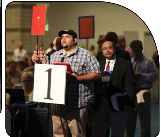
Commissioners and advisory delegates line up to debate.