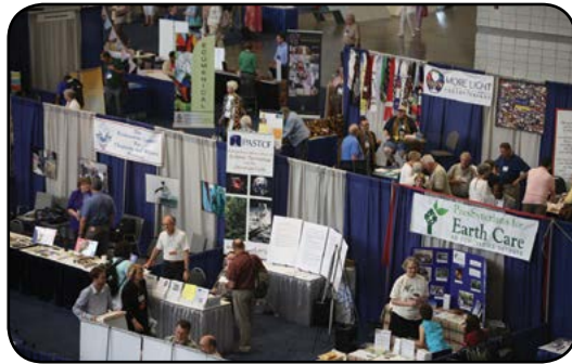
A sample of the variety of booths featured in the 220th GA Exhibit Hall.