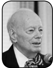
Wendell Freeman, a Tuskegee Airman and bombardier, addressed the National Black Presbyterian Caucus Dinner.

Also on recommendation of its Assembly Committee on Confessions of the Church, the Assembly voted 395-264 to initiate the study process that could lead to the inclusion of the Belhar Confession in the PC(USA)'s The Book of Confessions . The Assembly in 2010 took the same action, but Belhar fell eight votes short of the required two-thirds affirmative vote by the presbyteries. The Assembly action included funds for education across the church about the confession, which was developed by South African theologians in the 1980s as their response to the sin of racism and the practice of apartheid in that country.