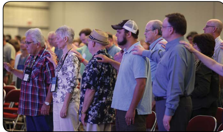
220th GA commissioners and advisory delegates pray during the GA Breakfast on Monday morning.