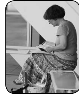
Commissioners stayed busy throughout the day studying materials.