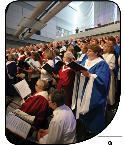
Combined mass choir provides glorious music during the opening worship for the 220th General Assembly.