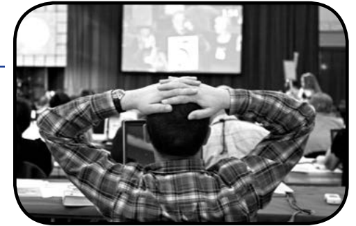
Commissioners spent long hours studying, discussing and praying about important issues before them.

And the Assembly asked the Presbyterian Mission Agency to provide “basic accessibility of essential GAMC information to major non-English language groups, specifically Korean and Spanish.