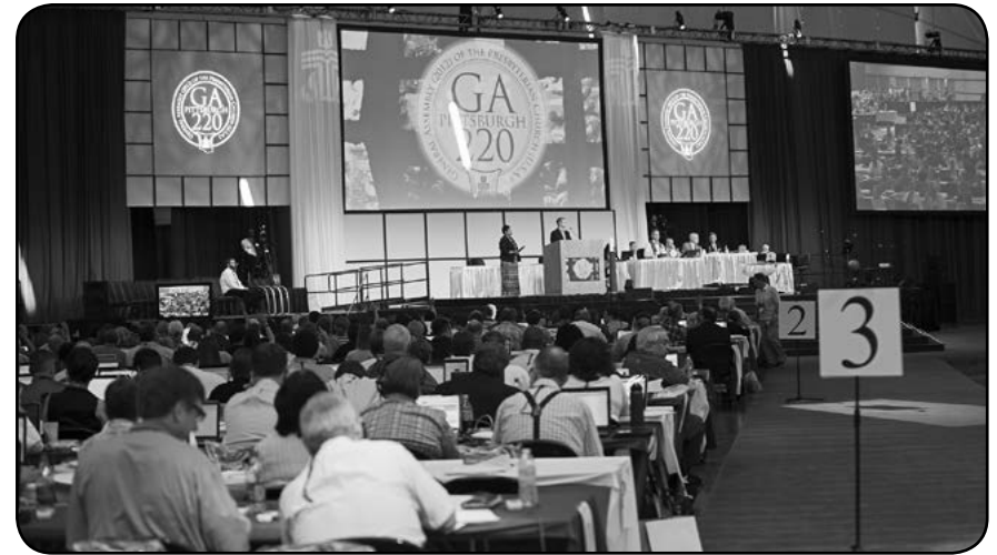
The Assembly Hall for the 220th GA.