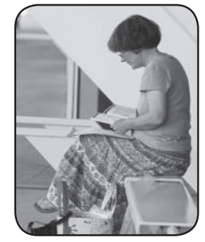
Commissioners stayed busy throughout the day studying materials.