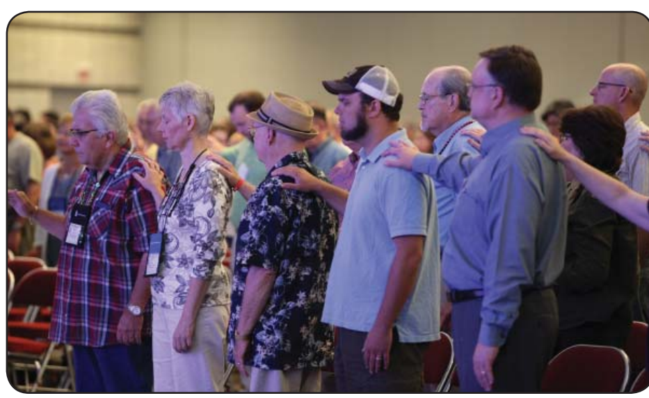
220th GA commissioners and advisory delegates pray during the GA Breakfast on Monday morning.