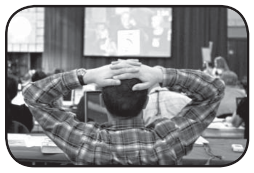
Commissioners spent long hours studying, discussing and praying about important issues before them.

its Special Committee on the Nature of the Church in the 21st Century. The report's plethora of recommendations include finding new ways to start new churches and revitalize existing churches, to affirm bi-vocational ministry, encouraging seminaries to offer courses that help prepare students for emerging cultural realities, urging presbyteries to develop better strategies for reaching immigrant communities, expanding distribution of resources in multiple languages, revamping the church's compensation system, reaffirming the parity of ministry between teaching elders and ruling elders, training church leaders about white privilege and how it diminishes the church's witness, developing better resources to help councils of the church move into the future, and mobilizing the church's public witness.