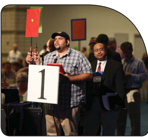
Commissioners and advisory delegates line up to debate.