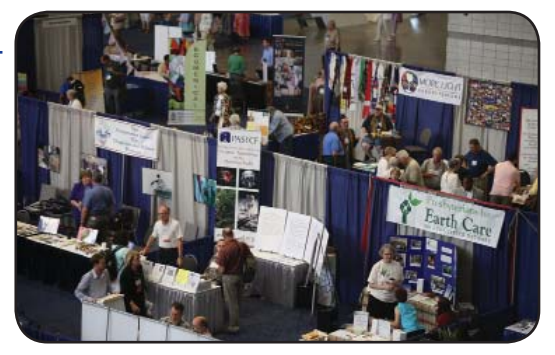
A sample of the variety of booths featured in the 220th GA Exhibit Hall.

The Assembly declined to lift a prohibition on holding national church meetings in Arizona. The ban was put in place by the Assembly in 2010 after the Arizona legislature passed an immigration law the church said would jeopardize the rights and safety of Presbyterians of color. Three-fourths of the law was recently thrown out by the U.S. Supreme Court, but the Assembly considered what remains of the legislation still a threat to people of color.